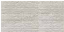
STONE RIDGED ANDES WHITE