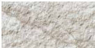
ROUGH SURFACE CASTOL WHITE