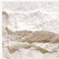
CROSSARD MUSHROOM STONE 052CR