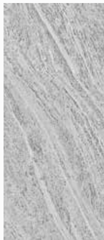
OCEANIC TRAVERTINE LIGHT CLOUD GREY