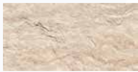
MOUNT CELESTIAL ANDES GOLD