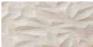
3D PAPEL ANDES WHITE