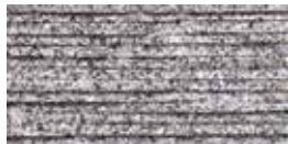
INFINITI GREYISH BROWN