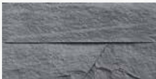
OBLIQUE MUSHROOM 043 CR BLACK