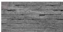
35 PIECE STONE NILE DARK GREY