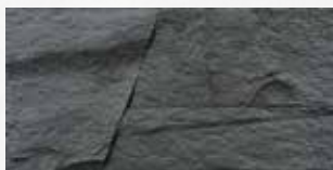
OBLIQUE MUSHROOM STONE 043 CR