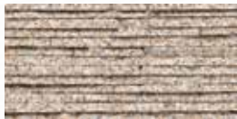
INFINITI GOLD SESAME