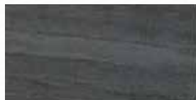
ROUGH SURFACE NILE BLACK