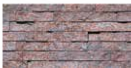
35 PIECE STONE MULTI COLOR RUST