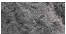
ROCK FACE STONE BRUCE DARK GREY