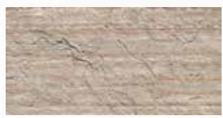
MOUNT CELESTIAL KAMU RED