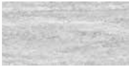
TRAVERTINE PRO CLOUD GREY