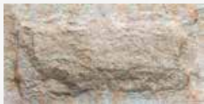
CROSSARD MUSHROOM STONE ANDES YELLOW