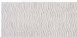
ROPE WAVE A HY001