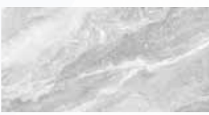
MARBLE VEIL GREY