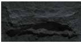
MUSHROOM STONE 043