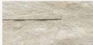
OBLIQUE MUSHROOM ANDES YELLOW