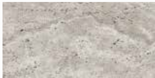
TRAVERTINE ANDES GREY