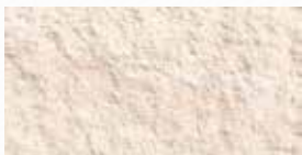
ROUGH SURFACE NILE MEDIUM YELLOW