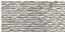
CHISELED STONE ANDES WHITE