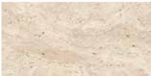
TRAVERTINE ANDES YELLOW