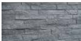
35 PIECE STONE GLACIER BLACK