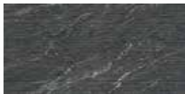
STONE RIDGED JADE RIVER BLACK