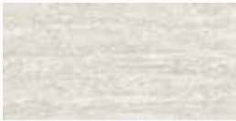
TRAVERTINE PRO CLOUD YELLOW