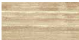
RAMMED EARTH WALL EGYPTIAN YELLOW