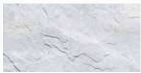
MOUNT CELESTIAL VEIL WHITE