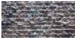
CHISELED STONE MULTI COLOR BLUE