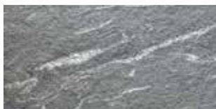
ROUGH SURFACE JADE RIVER BLACK