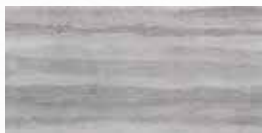
RAMMED EARTH WALL LIGHT GREY