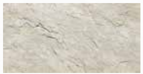
MOUNT CELESTIAL CASTOL YELLOW