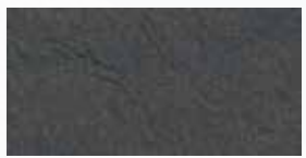
MOUNT CELESTIAL H06 CR