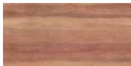
RAMMED EARTH WALL RED