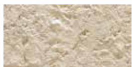
ROCK FACE H001