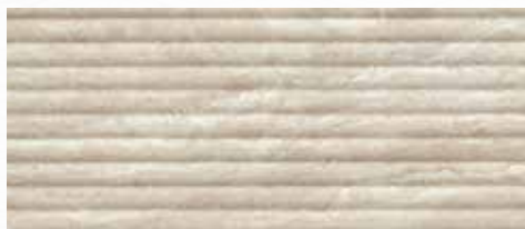
ARCUATE ROCK ANDES YELLOW