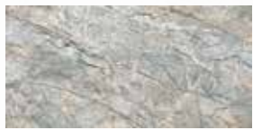
MOUNT CELESTIAL CASTOL BLUE