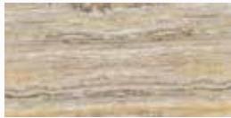
CORAL TRAVERTINE PERSIAN GOLD