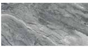
MOUNT CELESTIAL VEIL DARK GREY