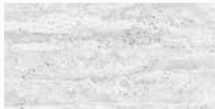
ROME TRAVERTINE CLOUD WHITE