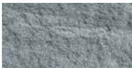
ROUGH SURFACE NILE DARK GREY